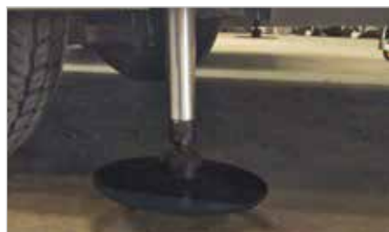
[5] Foot partially retracted.