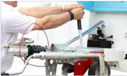
[13] Pull handbrake off.