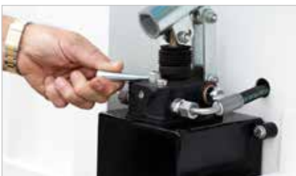
[22] Slowly move the lever to the right.