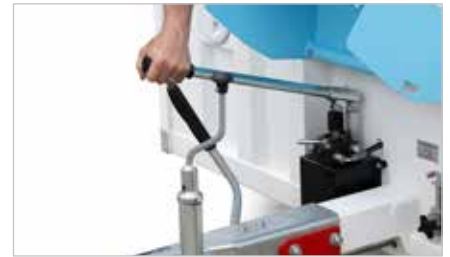
[3] Pump the hydraulic pump handle to extend the hydraulic rams until the two wheels are off the ground.