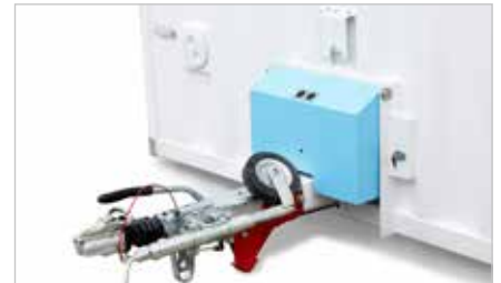
[27] Lower security hood and lock.