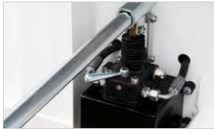
[2] Insert handle and ensure hydraulic pump lever is pointing to the left.