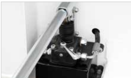
[1] Ensure the hydraulic pump lever is to the right.