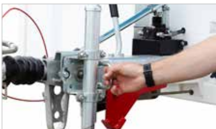
[10] Turn the jockey wheel 90 degrees.