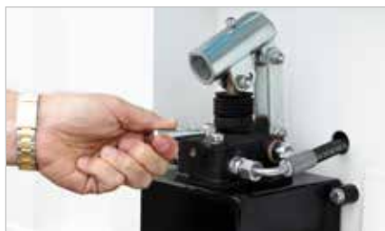
[23] As the lever is moved, the Chillbox will start to lower, the more you move the lever to the right, the faster it will lower.