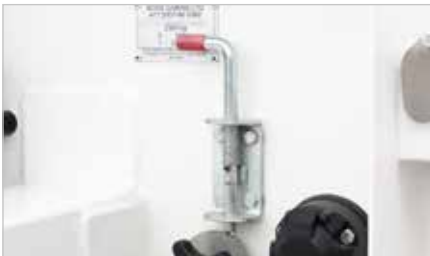
[19] Push rod back into plate.