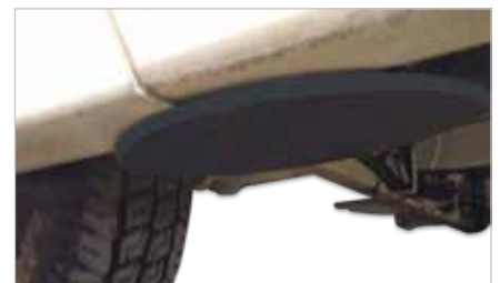
[6] Foot fully retracted.