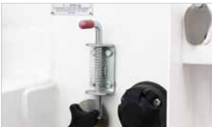
[16] Disengage the axle locking pins.