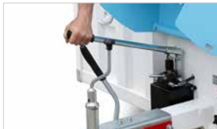
[2] Pump the handle until the hydraulic legs are completely retracted and the pumping action goes tight.