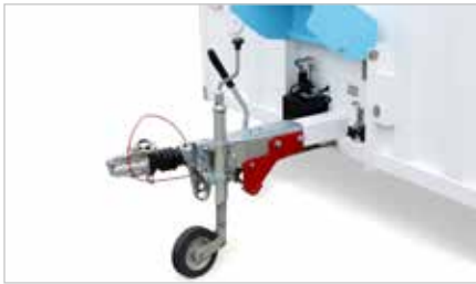
[1] Chillbox decoupled from the towing vehicle and handbrake on.