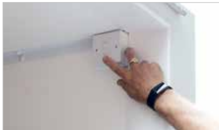
[8] Switch in ON position – Light ON and Chiller OFF.