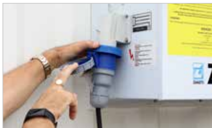
[5] Lock the cable in place by turning the collar on the chiller socket.