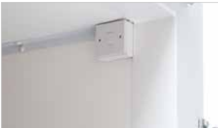
[7] Switch in OFF position – Light OFF and Chiller ON.