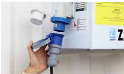
[4] Insert 32 Amp Single Phase cable plug.