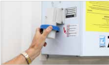
[1] Remove socket cover.