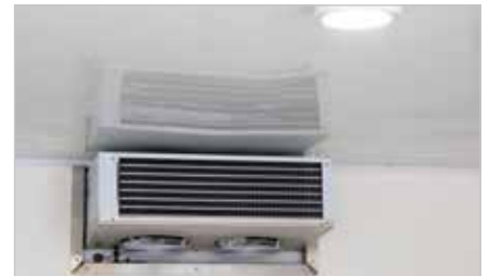
[9] With switch ON – Light ON and Chiller OFF.